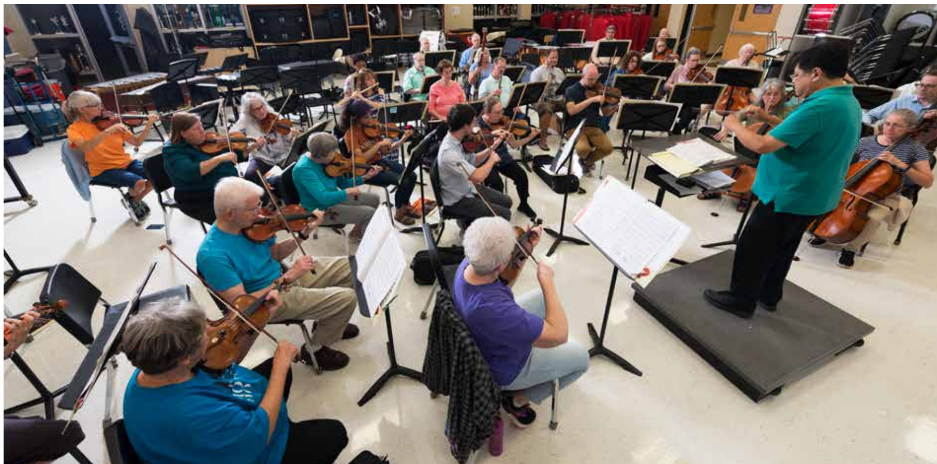
Practice makes perfect: the symphony practices regularly to prepare for its five annual performances.