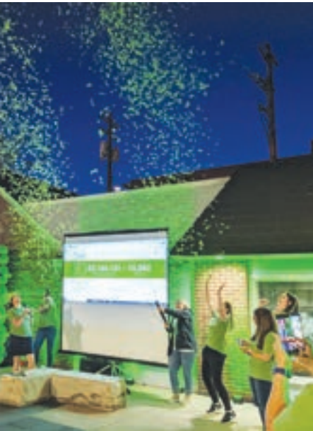
The Centre Foundation team celebrated the final four hours of Centre Gives with the community during Centre Gives Fest.

Centre Gives raised over $2.1 million for 200 nonprofits in 2022.